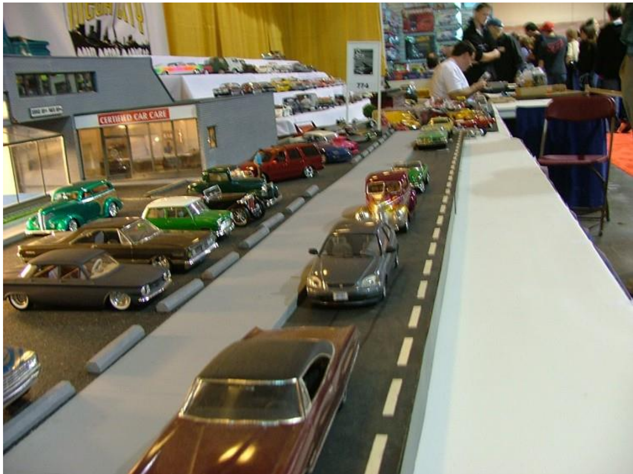
'Hank's Ford' in honour of the Ford's 100th Anniversary in 2003